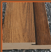
PLASTPRO PF™ FRAME with HydroShield Technology®