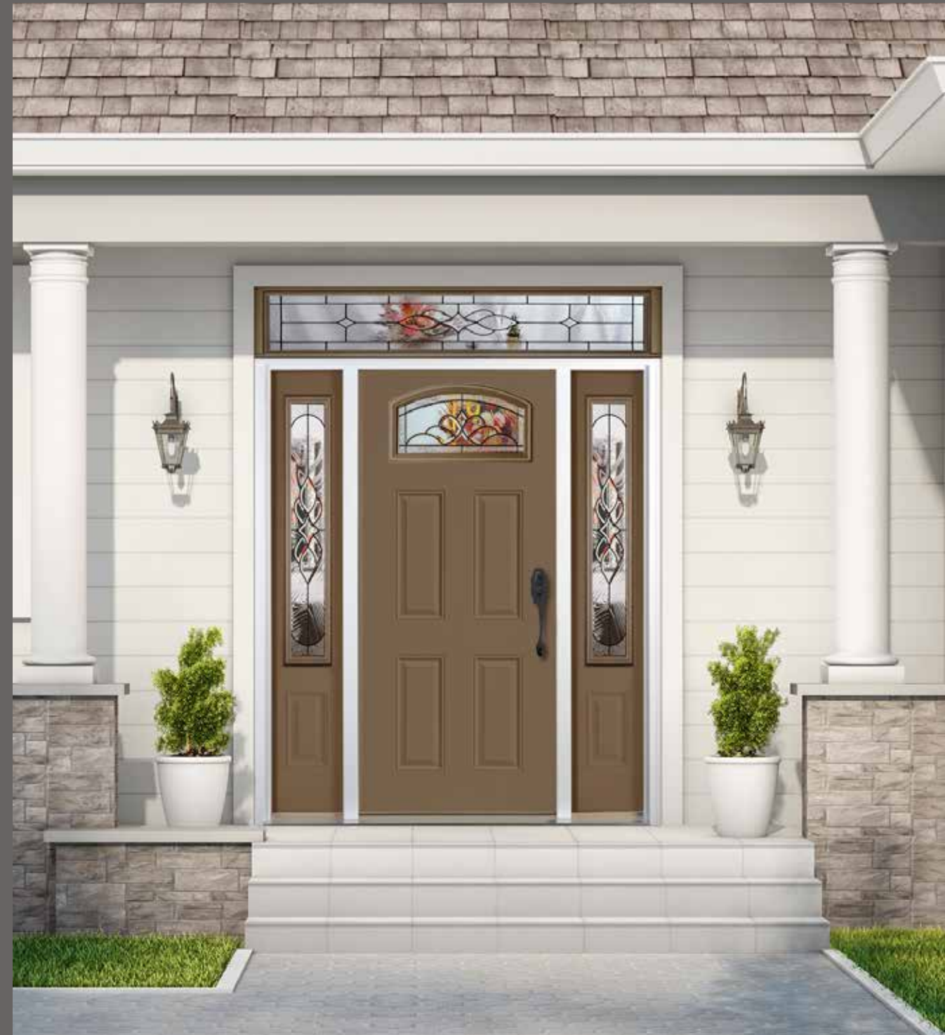
Door: EDR29 with Brigantine Glass – Sidelights: ESL82 with Brigantine Glass

STEEL DOORS www.targetwindowsanddoors.com